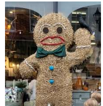
The Gingerbread Man