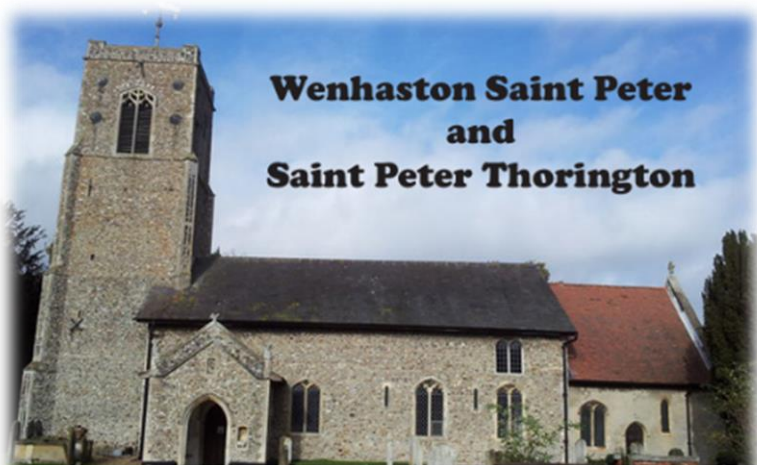
Wenhaston Saint Peter and Saint Peter Thorington