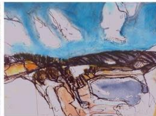
Sally Erb Surprise Acrylic on canvas