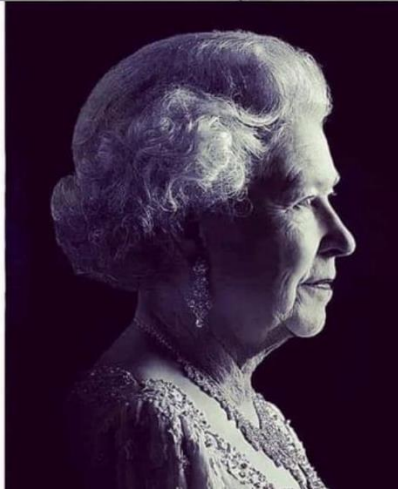
HM Queen Elizabeth II 1926-2022