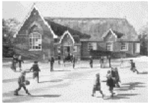
WENHASTON PRIMARY SCHOOL

Monday–Friday, 12.00–1.00 term time only, £9 per hour , to start immediately