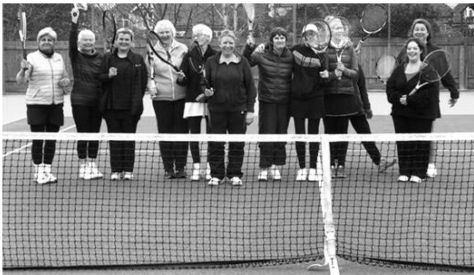
Wenhaston Tennis Club Members