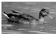
A male Mallard in ‘eclipse’ plumage