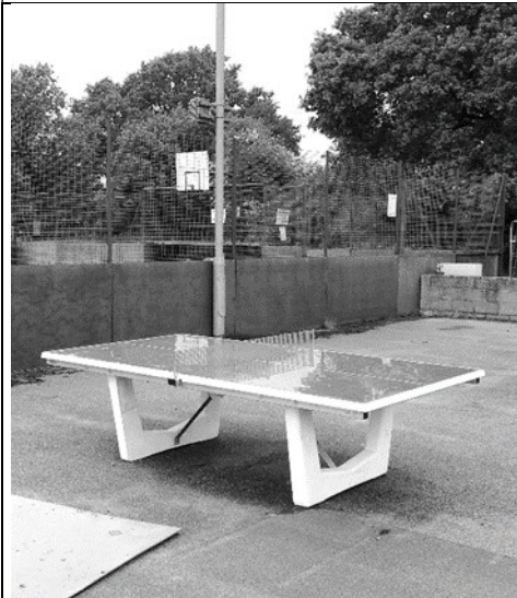
Outdoor Table Tennis