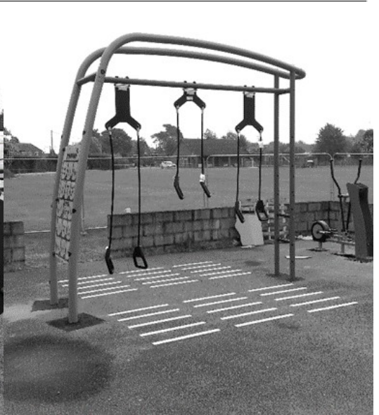
Outdoor Gym Equipment