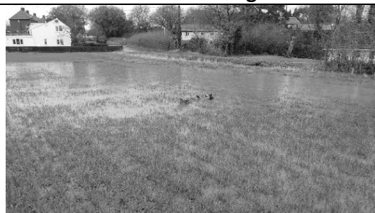
Dabbling ducks on the flood plain.