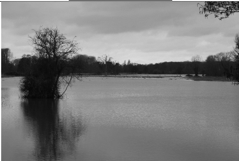
The Swim to Halesworth.