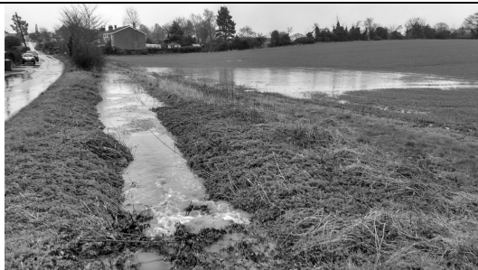
The Back River breaking its banks.