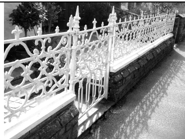
Railings from Yarmouth