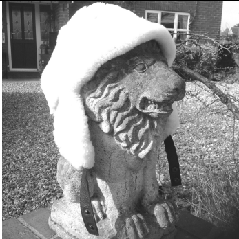
Richard the Lion Hat