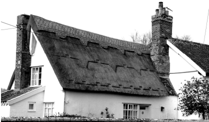
A Rare Wenhaston Thatch.

Our Senior Wall Correspondent has been on location with the film crew this month and found some interesting architectural features around the village.