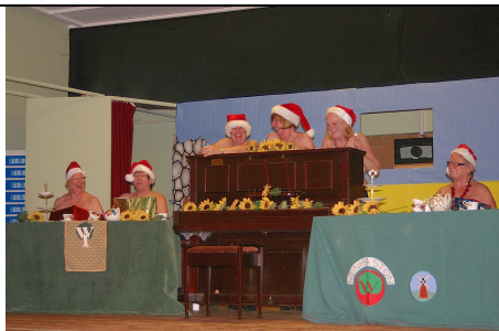
Do they know the camera behind them is running?

WISHING A HAPPY, PEACEFUL AND SAFE NEW YEAR TO THE WARBLER FAMILY OF CONTRIBUTORS AND READERS