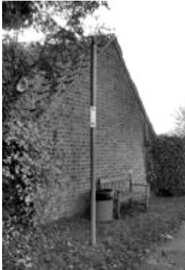
Is this the last post?

Boys show off, pull your hair and tell fibs and Miss says they have got bad habits so they should go to the naughty room. My Dad's a boy, but he is kind and he believes in Father Christmas because he can't afford all the presents, so he doesn't have to go to the room.